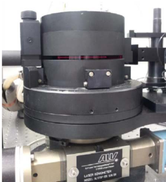
Fig. 1: Close-up of the index matching vat.

ALV 5000e compact goniometer system (ALV Langen, Germany)